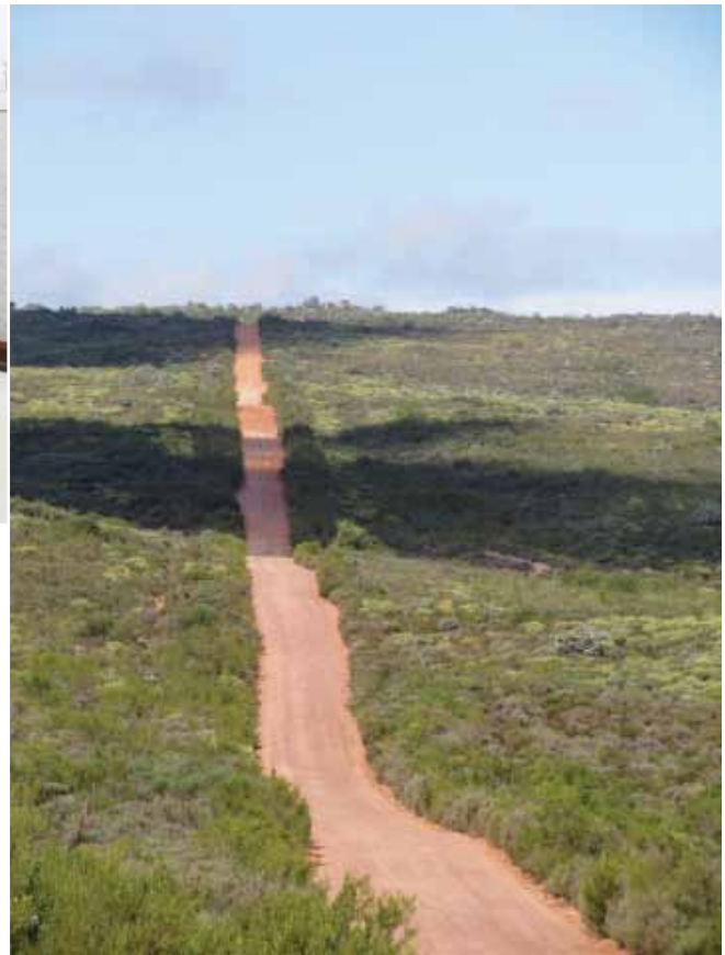
From a small and sparsely populated region, rooibos has become a livelihood to many, the subject of intense study and a tea enjoyed internationally.

yard to dry before being collected for grading, further processing in the factory and packaging.